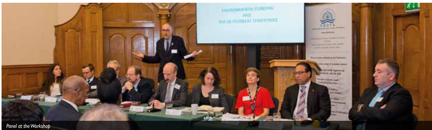
Panel at the Workshop

A networking session enabled delegates from the Territories to make contact with UK-based delegates. The UKOTA Environment Working Group continues to follow up on these discussions.