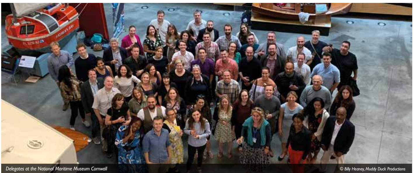
Delegates at the National Maritime Museum Cornwall

A link to resources from the Symposium is available on request from Ascension Island Government Conservation Department and coverage can be accessed on Twitter from #BlueBeltSymposium and @ExeterMarine