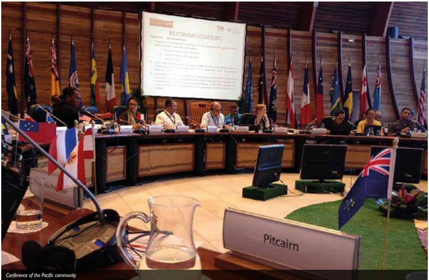
Conference of the Pacific community

As well as being a member of the associations of UK and EU territories, the Pitcairn Islands are also part of the Pacific Community. The Pacific Community is made up of 26 Countries and Territories in the Pacific region - from small territories like Pitcairn to major Pacific players like Australia, New Zealand, France and the United States. There is a significant EU presence in the Pacific, indeed the EU is the largest donor to the region.