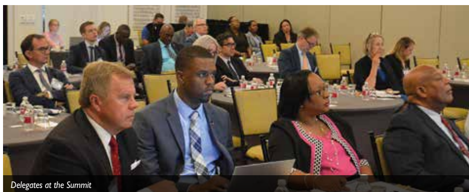
Delegates at the Summit