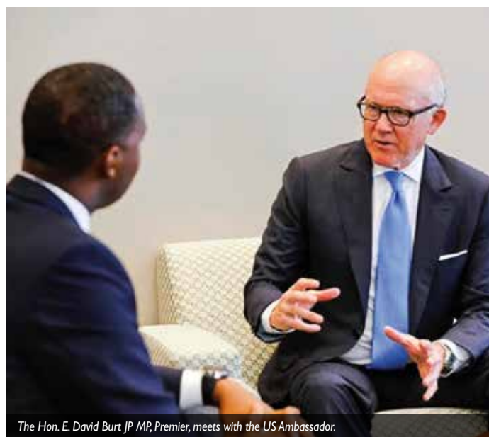
The Hon. E. David Burt JP MP, Premier, meets with the US Ambassador.