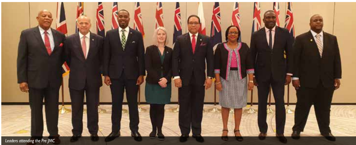
Leaders attending the Pre JMC

The Cayman Islands Government acted as hosts to the Premiers, Leaders of Delegations and UK Representatives from the Overseas Territories for this year's pre-Joint Ministerial Council meeting. Almost all members of the UK Overseas Territories Association were represented.