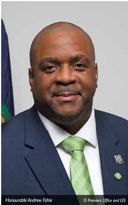
Honourable Andrew Fahie