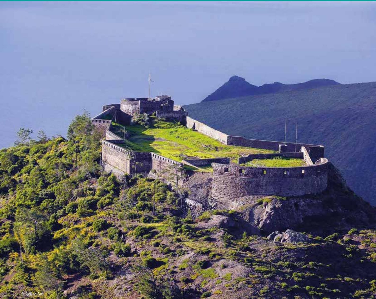
St Helena Fort