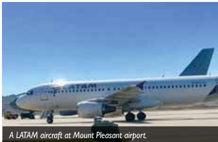
A LATAM aircraft at Mount Pleasant airport.

An agreement has been finalised with LATAM Airlines Brazil to introduce a second international commercial air link to the Falkland Islands with a weekly service from São Paulo/ Guarulhos (with a monthly stop in Cordoba, Argentina), complementing the existing weekly flight from Santiago, Chile.