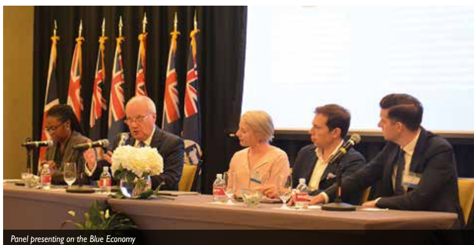
Panel presenting on the Blue Economy

Sessions covered at the Summit included: luxury and eco tourism; the blue economy; healthcare provision; and building a fintech economy.