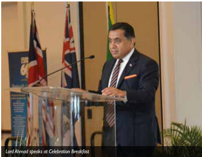
Lord Ahmad speaks at Celebration Breakfast