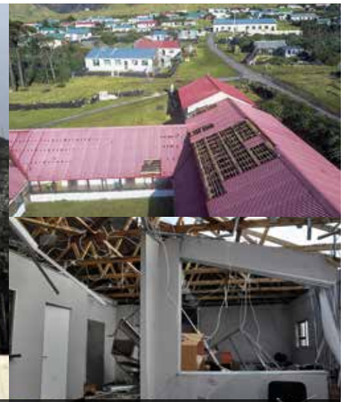
Left: Government accommodation opened to the elements. Top right: St Mary's School suffered extensive damage. Bottom right: devastation inside the police station.