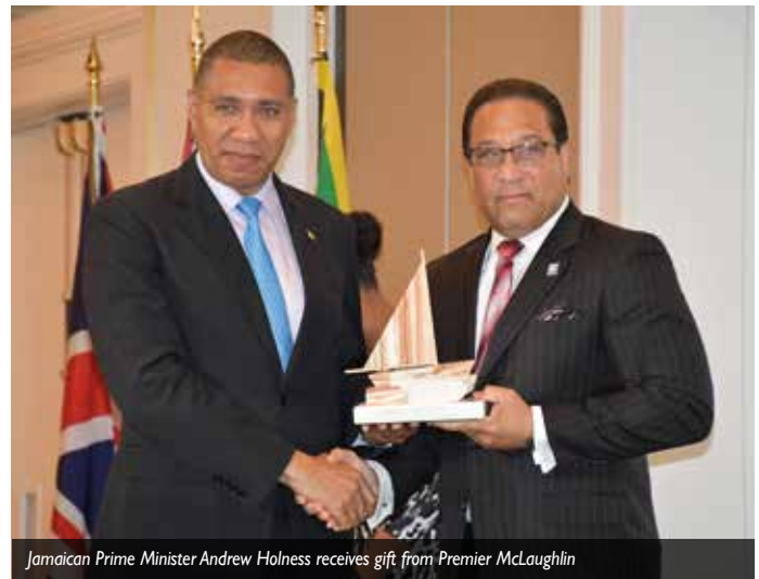
Jamaican Prime Minister Andrew Holness receives gift from Premier McLaughlin