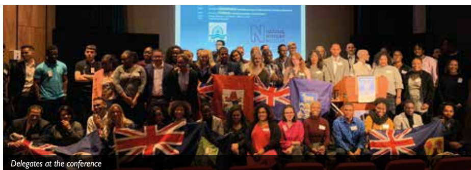
Delegates at the conference

Students were invited to produce a short film depicting their homeland, under the broad 'Identity' theme. Films were shown at the conference as part of an Overseas Territories Film Festival, and were judged by the political and cultural geography academics Dr Alasdair