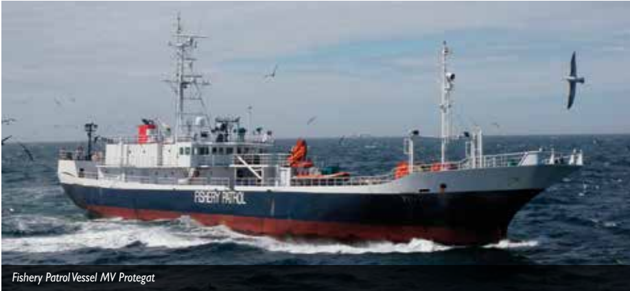
Fishery Patrol Vessel MV Protegat

Fines totalling £573,000 in two separate cases have sent a clear message to the international fishing community that the Falkland Islands will not tolerate poor practices and licence breaches within the fishery.