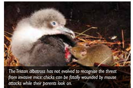
The Tristan albatross has not evolved to recognise the threat from invasive mice: chicks can be fatally wounded by mouse attacks while their parents look on.

A £7.6m fund-raising campaign has begun with an appeal to the UK Government, whose role in preserving Gough is enshrined in international treaties. Trusts and individuals will also be approached. To donate, please search online for Gough Restoration Donation. If the target is hit, work will start in the southern winter of 2019.