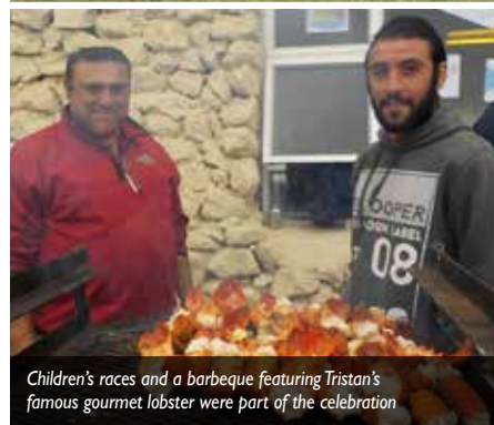
Children's races and a barbecue featuring Tristan's famous gourmet lobster were part of the celebration