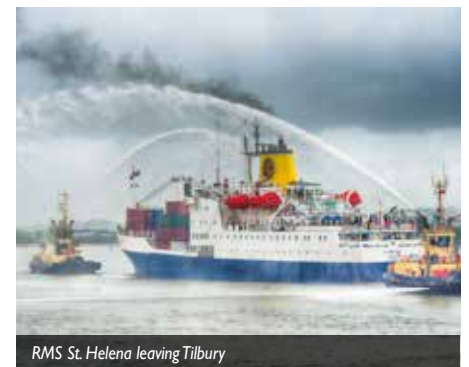
RMS St Helena leaving Tilbury