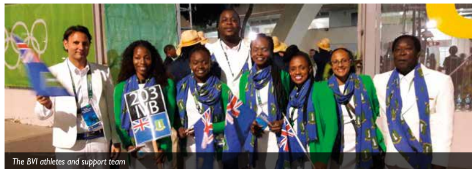
The BVI athletes and support team