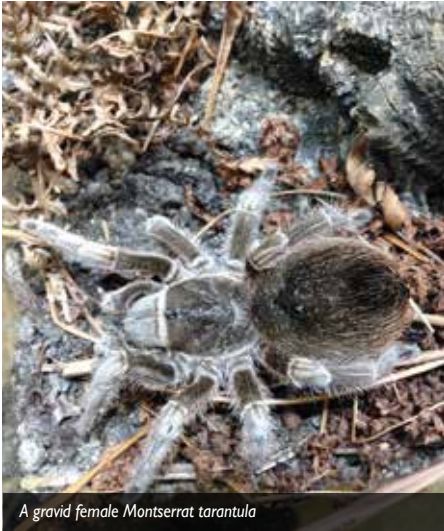
A gravid female Montserrat tarantula

A rare species of spider found only on the Caribbean island of Montserrat has been successfully bred at a zoo in the UK.