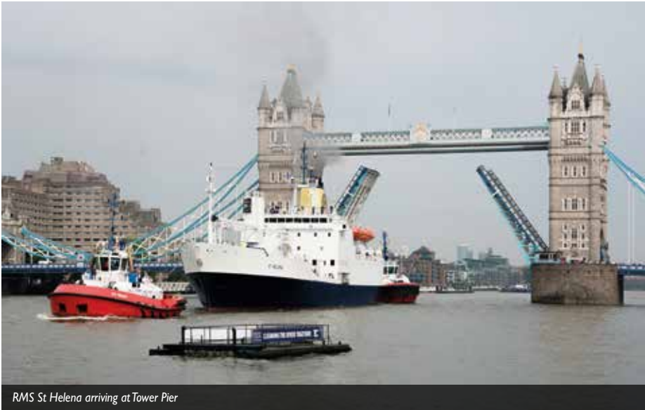
RMS St Helena arriving at Tower Pier