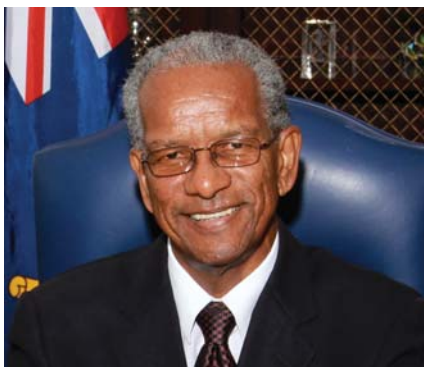
▲ Premier Dr. Hon. D. Orlando Smith OBE

The British Virgin Islands was inducted into the World Finance Magazine's list of 100 international financial centres, produced by World