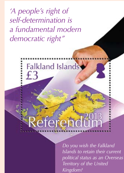
▲ A special stamp issue to mark the Referendum

reaching programme of overseas visits, to the United States, Central and South America, the Caribbean and Europe, in order to publicise the result as widely as possible.