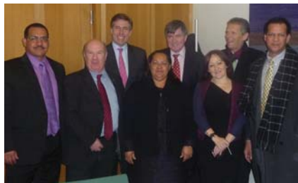
▲ Premier of Cayman, Deputy Premier, Governor and some representatives of the Cayman APPG

The Premier first made a call on the Minister for the Overseas Territories, Mark Simmonds MP and afterwards said, "I said to Mr. Simmonds that we wanted a new relationship with the Foreign Office based on constructive dialogue