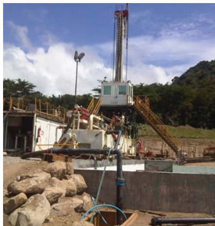
▲ Drill Rig

The geothermal development seeks to bring that hot water to the surface where it can then be used in a steam turbine engine to generate electricity. In this way we do not need to use a fuel such as coal or diesel oil to heat the water to steam to use in an engine to generate our electricity. Nature has provided it for us.