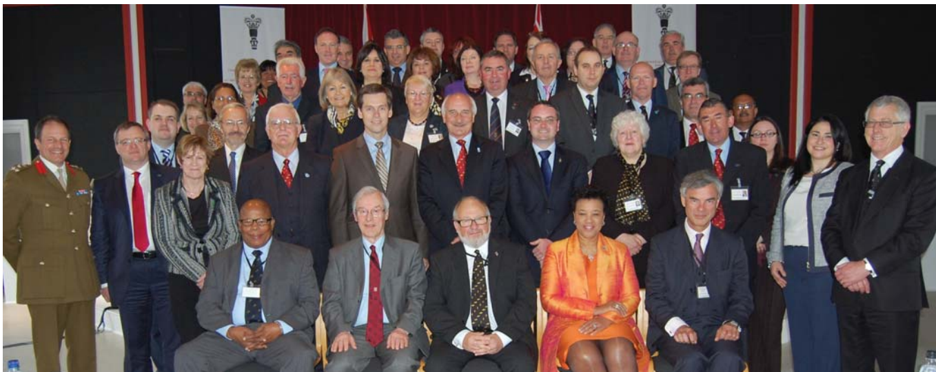
▲ Delegates at the Conference

The 43rd British Islands and Mediterranean Region (BIMR) Annual Conference of the Commonwealth Parliamentary Association (CPA), held in the Falkland