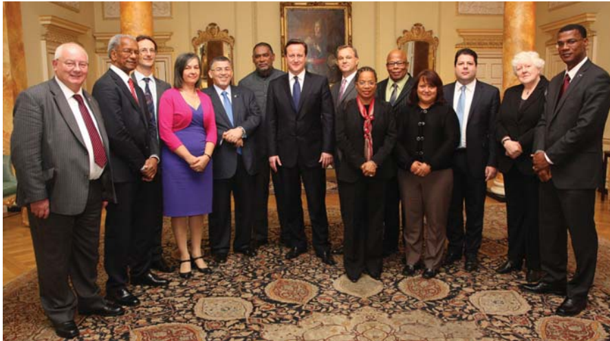
▲ Heads of Overseas Territories JMC delegations with UK Prime Minister Rt. Hon David Cameron MP and Foreign and Commonwealth Minister, Mark Simmonds MP