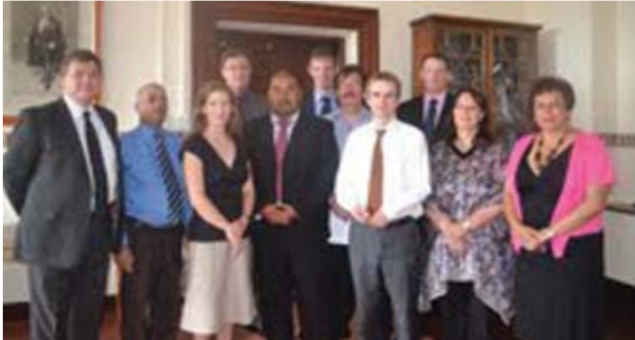
▲ St. Helena Government officials with DAPM team