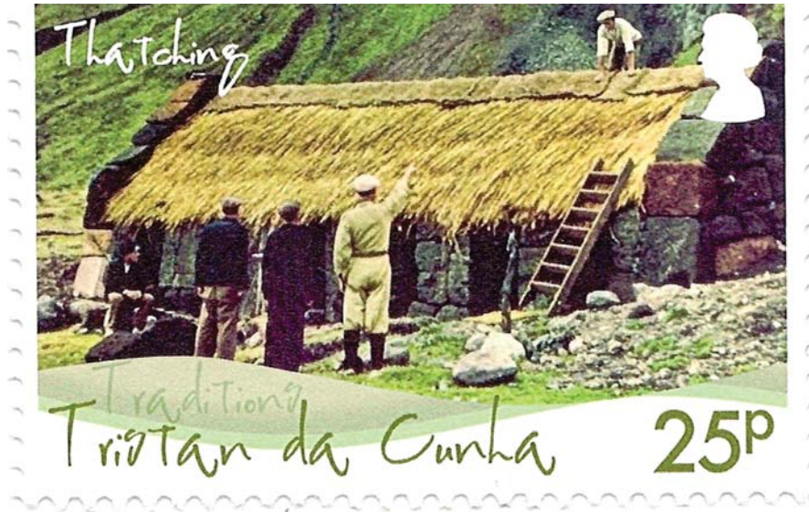
▲ Thatching a traditional Tristan cottage -- as reconstructed by the island pensioners - depicted on one of the island's much-collected postage stamps.

Fifty years ago, the hardy people from the most remote inhabited island on the planet, were re-building their community, after exile near Southampton 6,500 miles away in 1961 by the eruption of the volcano that dominates their spectacular home in the South Atlantic. They chartered a ship and sailed back to Tristan da Cunha.