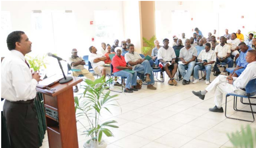
▲ Deputy Premier Dr. Hon. Kedrick Pickering addresses the National Fisherman's Conference

The Ministry of Natural Resources and Labour hosted a National Fisherman's Conference on 1st March that officially kicked-off Government's drive to develop the fishing industry.