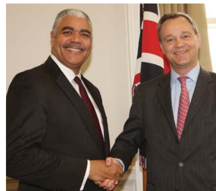
▲ The Premier of Bermuda, The Hon. Craig Cannonier JP, MP and the Minister for Overseas Territories, Mark Simmonds MP.

On the occasion of the convening of the Legislature, on 8th February the Government produced its first Speech from