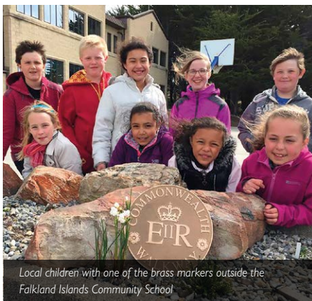
Local children with one of the brass markers outside the Falkland Islands Community School

Over the course of three months straddling the New Year, two brass markers forming part of the Commonwealth Walkway, were laid in Stanley, the capital of the Falkland Islands. The Commonwealth Walkway Scheme was launched by the Outdoor Trust following the success of the Jubilee Walkway in London, which formed part of Her Majesty the Queen's Diamond Jubilee Celebrations of 2012.