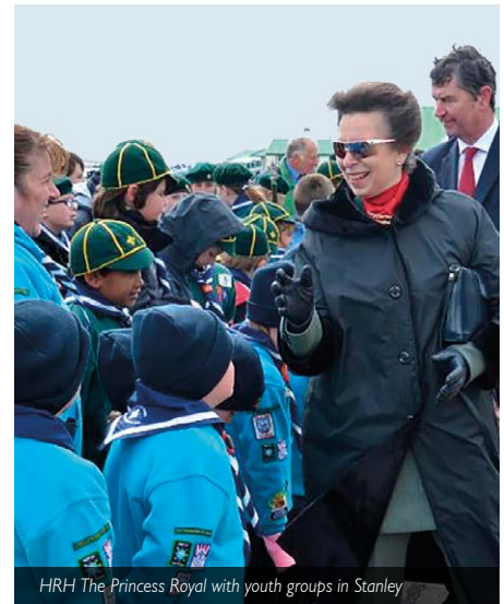
HRH The Princess Royal with youth groups in Stanley

Her Royal Highness The Princess Royal, accompanied by her husband Vice Admiral Sir Tim Laurence, visited the Falkland Islands in January 2016. It was the fourth time that she had been to the Islands, with her last visit having taken place in 2009.