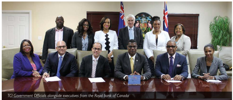
TCI Government Officials alongside executives from the Royal bank of Canada

"The TCI economy has seen a major turnaround over the past three years and, with its BBB+ credit rating, 4.3% GDP growth and consecutive budget surpluses, this will allow the Government to retire its $170M UK guaranteed debt. As a government, we can now make significant investments in the socioeconomic development of our people and country. This is indeed a proud moment for the Turks and Caicos Islands," said Premier Dr Rufus Ewing.