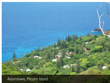
Adamstown, Pitcairn Island

A vast area of the Pacific Ocean is being designated for marine protection, with the support of Pitcairn Islanders.