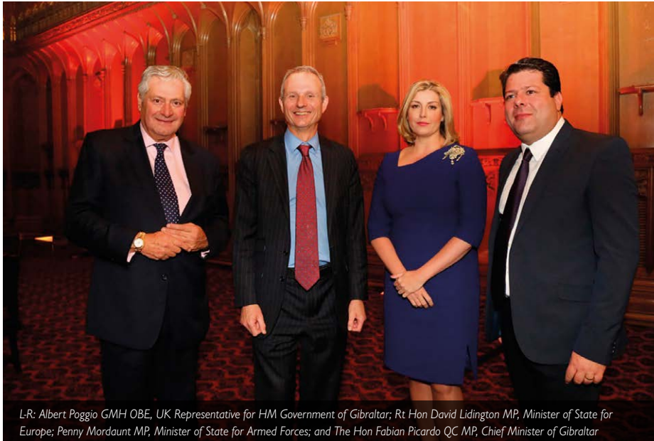
L-R: Albert Poggio GMH OBE, UK Representative for HM Government of Gibraltar; Rt Hon David Lidington MP, Minister of State for Europe; Penny Mordaunt MP, Minister of State for Armed Forces; and The Hon Fabian Picardo QC MP, Chief Minister of Gibraltar

On 12th October 2015 HM Government of Gibraltar hosted the 16th annual Gibraltar Day in London. The celebrations began with the now traditional Thanksgiving Mass in Fulham the day before and culminated in a reception for over 800 invited guests and dignitaries at the City of London's prestigious Guildhall.