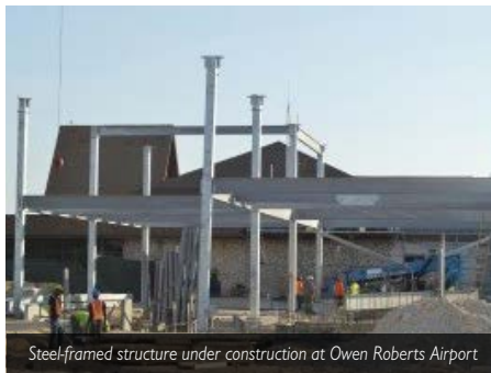
Steel-framed structure under construction at Owen Roberts Airport

Workers have begun erecting the 29,000 square foot steel framed building at Owen Roberts International Airport, the first phase in the expansion plan, which is on schedule despite the weather. Heavy rains in December caused a few delays to the groundwork but the project is on track, according to officials.