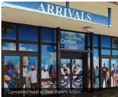
Caymankind mural at Owen Roberts Airport

Over 2.1 million visitors arrived in Cayman during 2015, making it, as expected, another record-breaking year. Both cruise and air arrivals were up during the last twelve months, with 385,379 total air arrivals, a marginal 0.67% increase over 2014. However, this was not only the most arrivals since records began but the 5th year in a row that the number of stay-over guests has increased, demonstrating the consistency of that market.