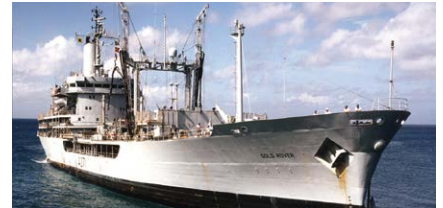
▲ RFA Gold Rover