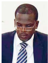
Speaking at the 44th Annual St Patrick's Co-operative Credit Union General Meeting, the Honourable Minister of