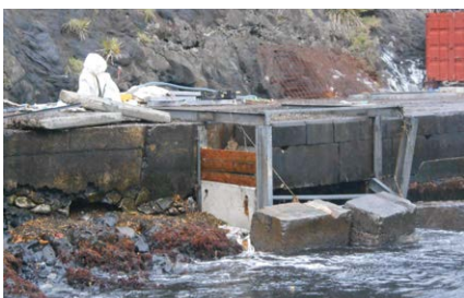
▲ Damage to Tristan's Calshot harbour

The alarm was raised when serious erosion was identified in the structure of Calshot Harbour; sole link with the fishing and freight vessels that maintain the Tristan economy. Chief Islander Ian Lavarello journeyed thousands of miles through the