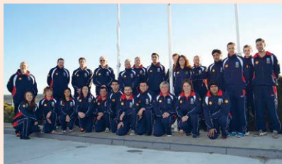
▲ Falkland Islands Team ready for Jersey

Thirty years later, this year's Games, held in Jersey from 27th June – 3rd July, was attended by 3000 competitors from 24 islands from around the world, competing in 14 different sports. The Territories of Bermuda and Gibraltar have both hosted past Games and amongst the competitors this year were teams from Bermuda, the Cayman Islands, the Falkland Islands, Gibraltar and St Helena.