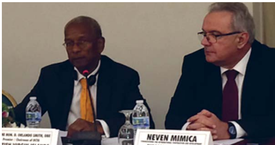
▲ Dr. the Hon. D. Orlando Smith OBE, Premier of BVI, and Commissioner Neven Mimica, European Commission

The British Virgin Islands (BVI) had its day in the sun on 27th February after the Government successfully hosted a week of international meetings in the Territory. Premier Dr. the Honourable D. Orlando Smith OBE, led high-level talks on sustainable development and international and regional cooperation involving the European Union (EU), the Overseas Countries and Territories (OCTs), EU Outermost Regions (ORs); the United Kingdom (UK), France, Netherlands and Denmark; and other development partners.