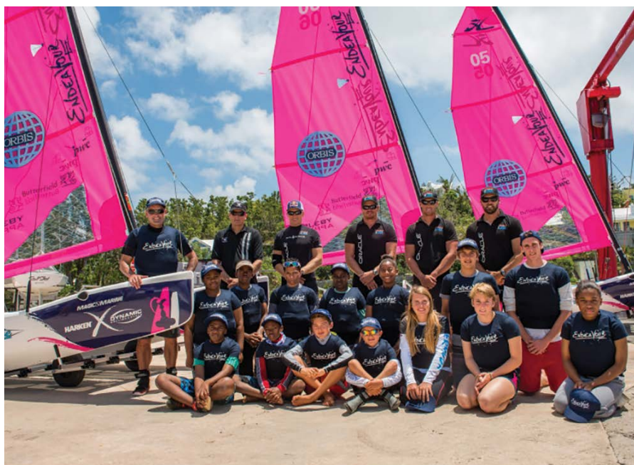
▲ Endeavour Programme participants