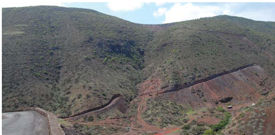
▲ The 14km long Haul Route from Rupert's Valley to the airport site

"This is tangible proof of the opportunities that are now coming to St Helena after decades of not having any. The challenge now is for all Saint people and businesses to fully exploit the development possibilities."