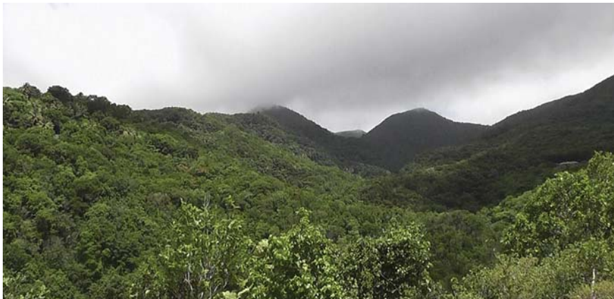
▲ Hill view of North Montserrat