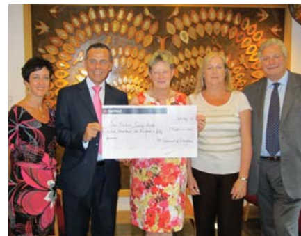
▲ Presentation of a donation to the Trust