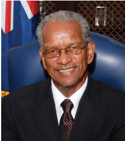
▲ Premier Dr Hon D Orlando Smith OBE

Under the leadership of Premier and Minister of Finance, Dr. The Honourable D. Orlando Smith, OBE, government in partnership with the private sector has established a Financial Services Business Development Committee (FSBDC). The Committee, which is comprised of public and private sector representatives, was formed to help enhance the financial services industry through the development of action plans for consideration by Cabinet. Working groups have already begun undertaking a review of the industry's various sectors to prepare initial recommendations. In a statement on the role of the FSBDC, Premier Smith said: "This committee is an asset to advise government on how best we can enhance and promote the financial services industry's offerings."