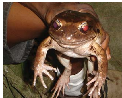
▲ Montserrat Mountain Chicken

A brochure which has been published by the Mountain Chicken Project highlights the scientific research that is taking place on the Island and how this would contribute to the management of the frog on both Montserrat and Dominica. This is being circulated widely throughout the Island including to schools and government institutions and members of the public are asked to report on any encounter with the frog.