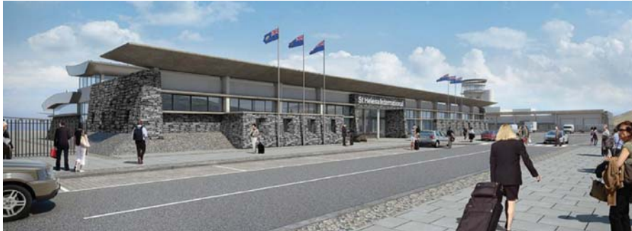
▲ Airport Terminal landside view of external finish

After years of semi isolation with access only by sea, - the RMS St Helena being the Island's lifeline - St Helena is preparing for an airport that is set to catalyse economic growth, draw inward investment and develop the Island's tourism sector.