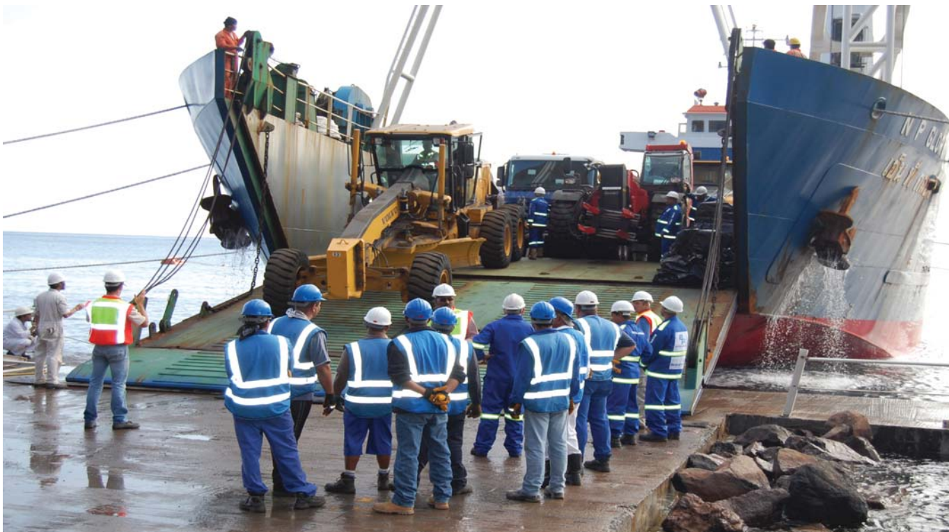
▲ Offloading of the heavy Plant