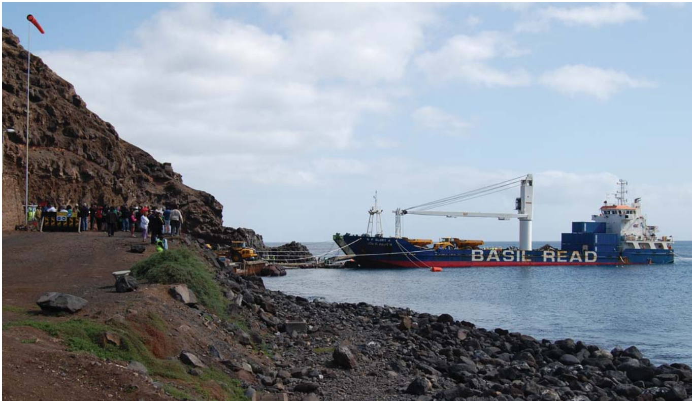
▲ The NP Glory 4 berthed alongside at Rupert's Bay